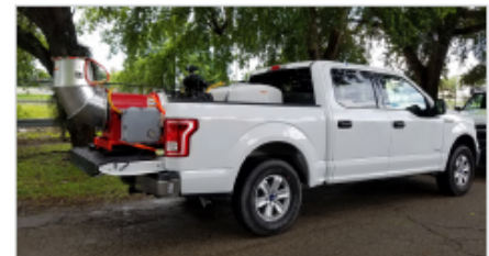
A truck with a different type of sprayer on the back.