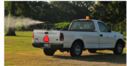
Mosquito control truck spraying Insecticide into the air

Spraying is safe. You do not need to leave an area when truck spraying for mosquito control takes place. If you prefer to stay inside and close windows and doors when spraying takes place you can, but it is not necessary. If you are having any type of health problems after spraying, contact your doctor or healthcare provider. The spray does not harm pets, but you may choose to bring them inside when spraying occurs.